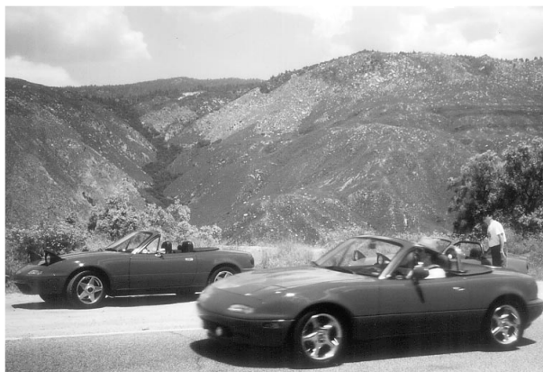
Right: The run uphill to Idyllwild had some members opening headlights to get more cold air to the engines.