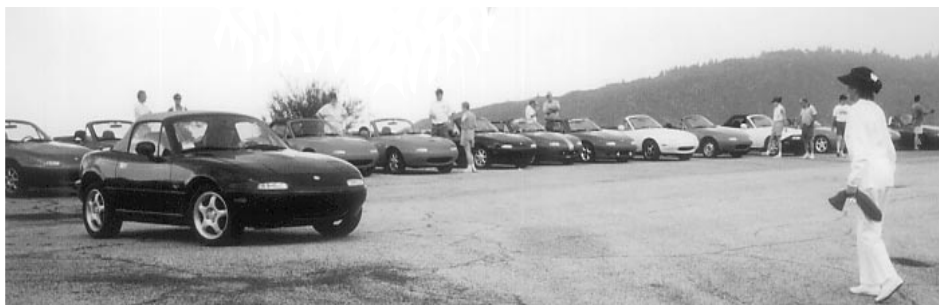
San Diego Miata Club members gather at an overlook as the rains came during the second half of the run to Idyllwild.

P.O. Box 2286 Spring Valley, CA 91979-2286