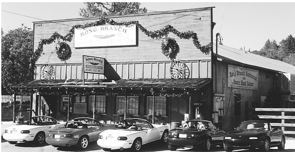
December's Day at the Beach Fun Run started with a trip to Julian

P.O. Box 2286 Spring Valley, CA 91979-2286