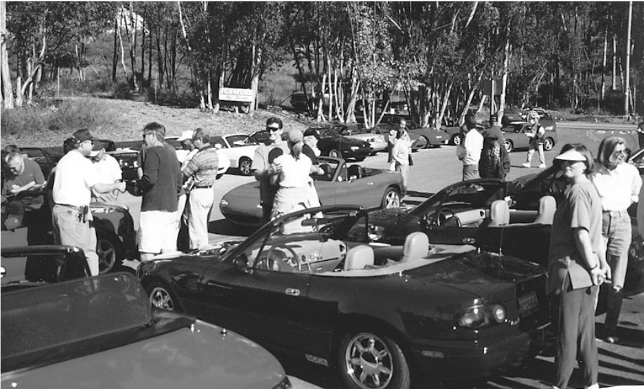
Over thirty Miatas gathered for the Fall Picnic Tour on November 24 th .