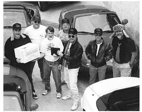
The exchange in LA.

After lunch and a tour of the house, the guys jumped in the Miatas to go tear up the local twisties. There are some great roads in this area. After about an hour of suspension evaluation, it was back to the house to pack