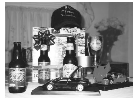
"Trophies" amidst some of the dead soldiers that it took to get them assembled.