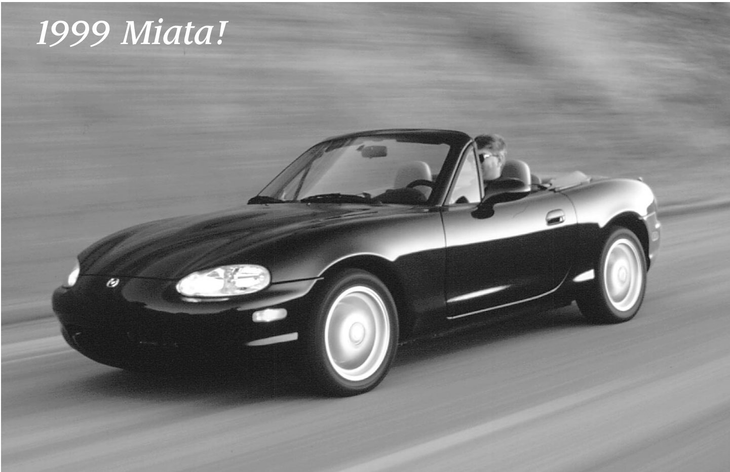
Above: Mazda Information Bureau. Below: auto.com web page