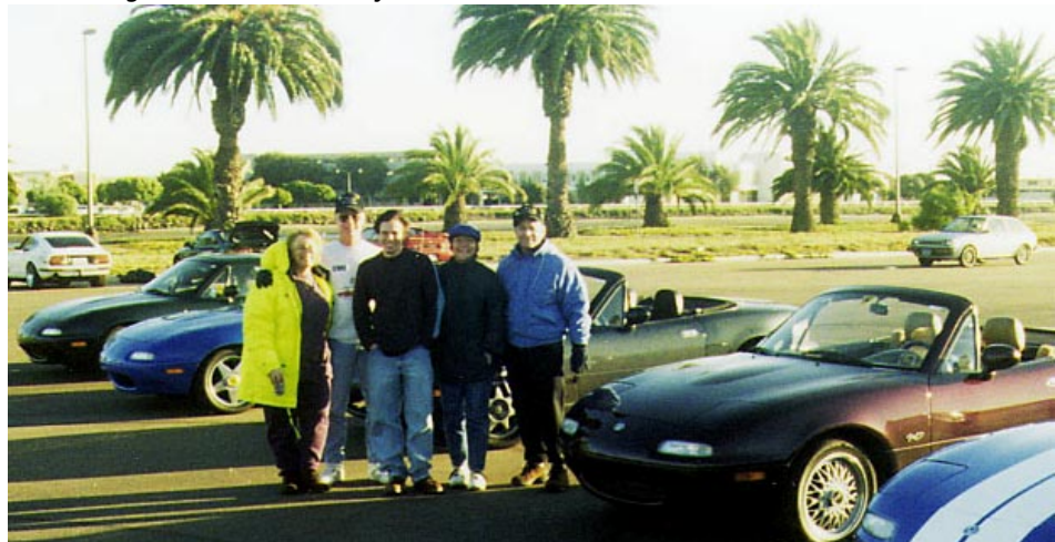
Still smiling at the end of the day