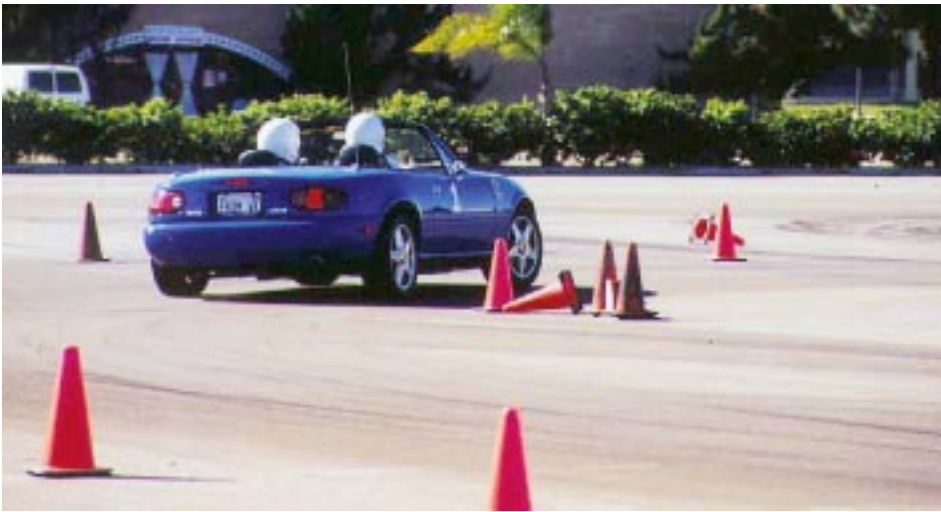
Voodoo Bob Krueger exiting segment two, the right 360