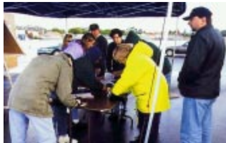
Signing up and drivers meeting

First, the course layout. The course consisted of five timed segments each with its own challenge. Having each segment timed individually allowed each driver to have a measurement of how they performed each of the five challenges through the day. The course started out with a slalom of four pylons. The next segment was a constant radius right circle followed by segment three, a 90°-left turn going straight setting up for segment four, a 90°-right sweeper into, what is called a "garage" followed by a sweeping right back to the circle for segment five, this time going to the right. The "garage" can be described best this way.