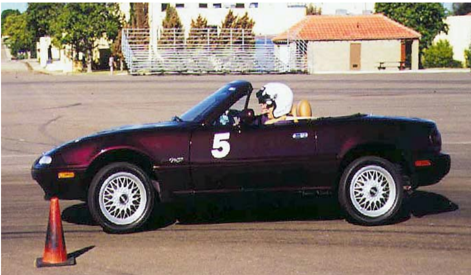
Barb Shev negotiating segment five, the left 360