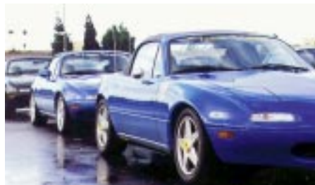
Lined up for the inspection