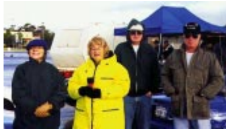
Cold, wet and smiling — let's get started!