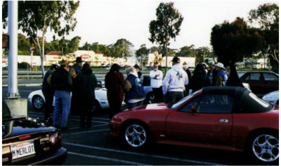
An alert early-morning crew assembles for the run north.