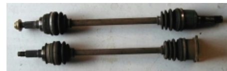
The halfshaft for the Torsen differential (top) is readily distinguished from the non-Torsen unit. The splined shaft fits into gears inside the Torsen unit.