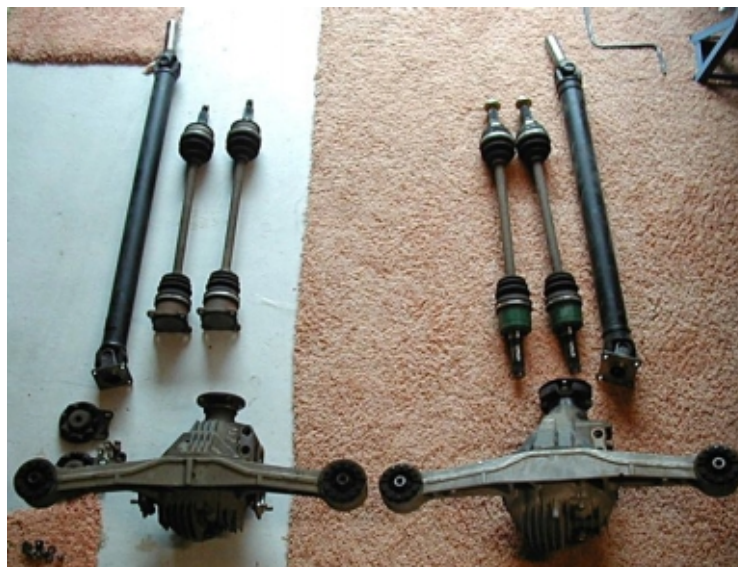
At first glance there appears to be little difference between the two rear differential assemblies from the 1992 on the left and the 1999 on the right.

Starting with the 1999 Miata (M2), Mazda went back to a 4.30 Torsen. But with all the changes to the upper and lower A-arms, would the M2 differential fit in my 1992 Miata? Now I had another challenge to find this information, which was more difficult than I had anticipated. None of the online sources contained any information on using an M2 differential