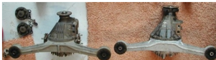
Closer examination of the rear differential housing will show a longer "nose" on the 1999 unit on the right. This is not indicative of a Torsen unit, as all 1994 and later differentials (either open or locking) have a longer nose than the 1990 to 1993 units.