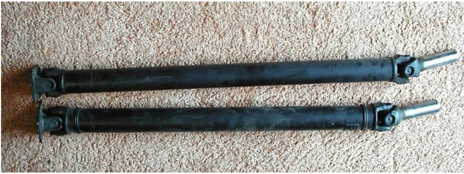
You can easily see that the propshaft for the 1999 unit (bottom) is shorter than the 1992.

frame (consult the shop manual on this part) and the cat-back exhaust. To remove the half shafts, we removed the upper hub bolt (that holds the hub to the upper A-arm) and while pulling on the upper part of the hub, hit the end of the half shaft with a rubber mallet until the half shaft popped out of the hub. We then pulled the drive shaft out. The differential itself is held up by two nuts (one on each end), plus four more nuts that hold two hard-rubber bushings in place.