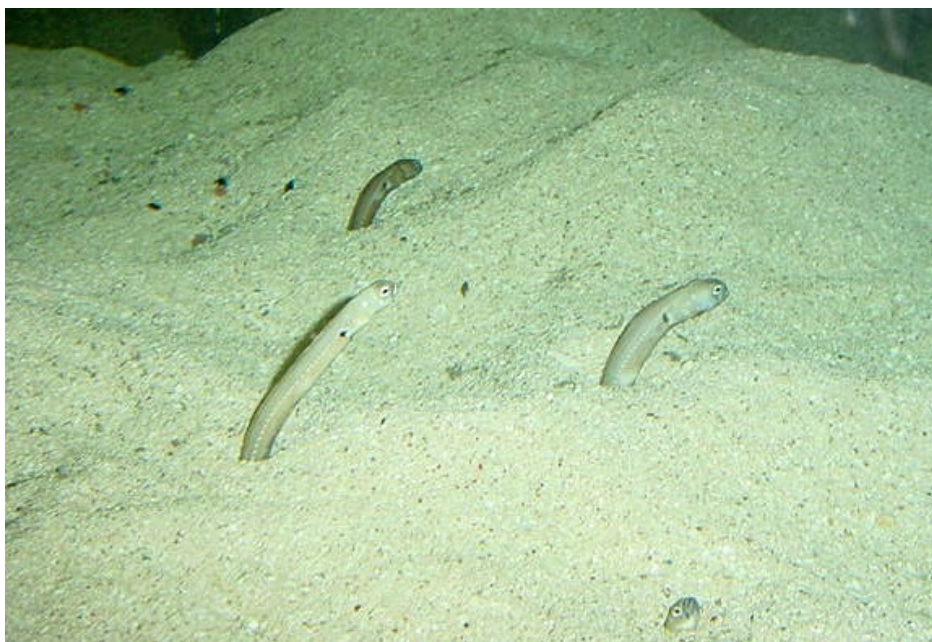
Everyone seemed to take notice as the colorful school of Miata swam past.