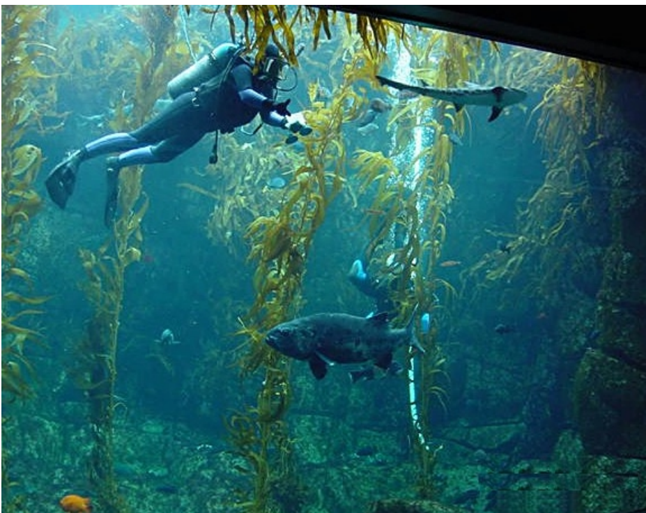
NO, it didn't rain that much! The Fishy Run made a highlighted stop at the Stephen Birch Aquarium. Inside the large tank, a diver interacts with the residents.