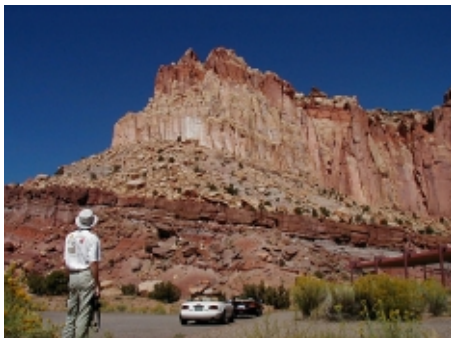
Lunch stop at Capitol Reef National Park