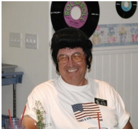
Left and Right— Everyone was ready to chow down when we made it to The Waffle Lady in San Clemente. We had the place to ourselves and a special menu to boot.

Below— The King's pompadour is looking a bit more like PepeLePew is sitting on his head by the end of the run.