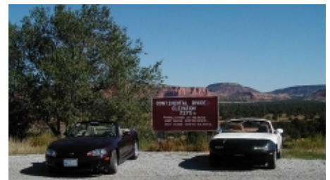
Continental Divide, Interstate 40 in New Mexico

the tops up for about 90 minutes to get through a thunderstorm, and the last morning we had to drive for about an hour `til the tops got warm enough to lower. Otherwise it was two weeks of top-down driving. For 3,467 miles we had managed to stay together, until we got within 15 miles of Provo and then became separated. Dennis found the motel first and had to guide me in. Including the Fall Leaf Run, we were on the road for 17 days and I logged a total of 4,648 miles.