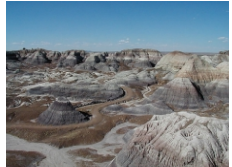
Blue Mesa, Petrified Forest National Park