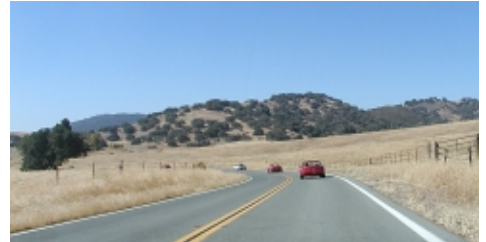
Above— This was a "Run" so there was some driving to be done. A total of 151 miles of it, in fact.