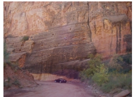
Find the Miata...Capitol Gorge, Capitol Reef National Park.

As we finished the last day of the Loneliest Highway Run with 22 parks, museums, and sites behind us it had been a near perfect trip. We had