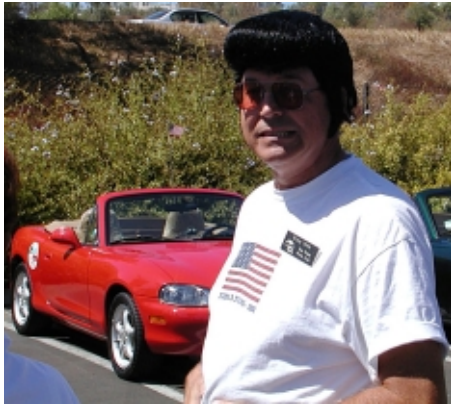
Everyone showed up for the Back to the 50's Run, even "The King" was there. Not looking too good there, King.