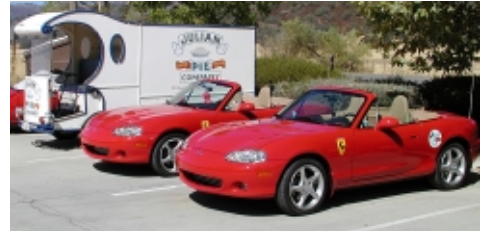
Above— A welcome stop at the Julian Pie Company along the way.