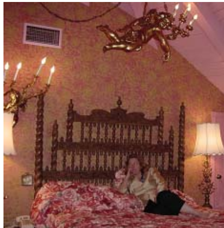
One of the austere rooms at the Madonna Inn.

After lunch, luggage was off-loaded into available rooms and, once again, most of the group assembled with full stomachs, empty bladders, and full gas tanks for the first official mileage run on some great Miata roads. The San Luis Obispo County Grand Acquaintance Tour helped work up appetites for the official banquet, where the coveted prizes donated by VOODOO BOB KRUEGER were presented to the most skilled or lucky winners of the trip quiz. It was fun to learn that at least 22 of our number have personalized plates and to figure out what