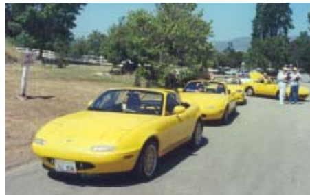
Above— The yellows park in an appropriate area, at least according to the sign.