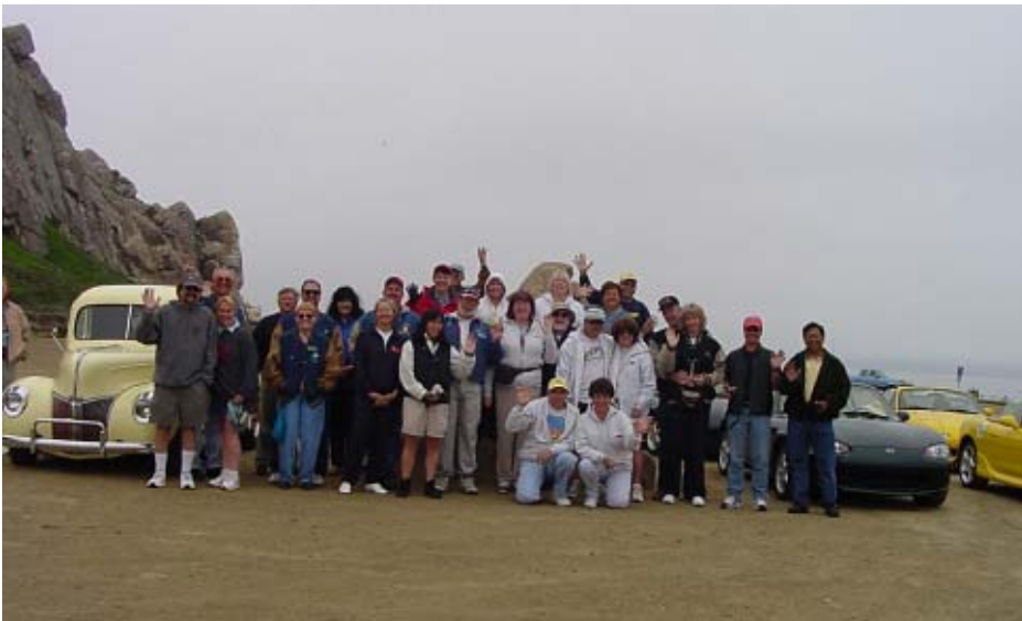
A happy, if slightly chilled, group of searchers at the base of Morro Rock.