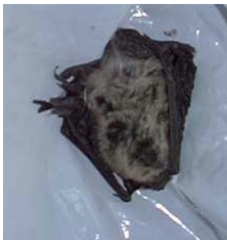
The bat. R.I.P.

July 27 - Saturday 8th Annual Twilight Run