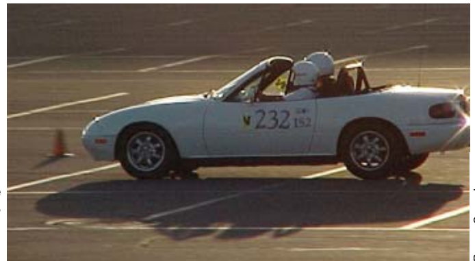
Right— Leo gets some instruction on the autocross course.

You can also mail it to the Club P.O. Box. Please include a photo. We want to be able see your face. — Your photo will be returned.