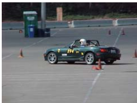
Kevin Haywood was the fastest SDMC time in IS2 on this day.