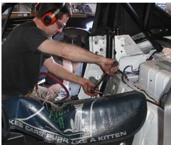
Left— A new roll bar gets installed