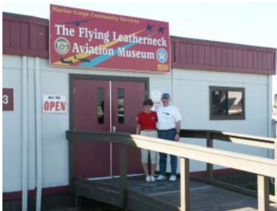
Left and Right— SAN DIEGO MIATA CLUB members enjoyed a scenic run before getting up-close with the aircraft on display at the Flying Leatherneck Aviation Museum on MCAS Miramar.