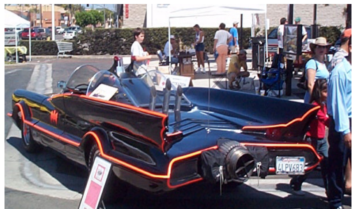
BATMOBILE SHOWED UP!