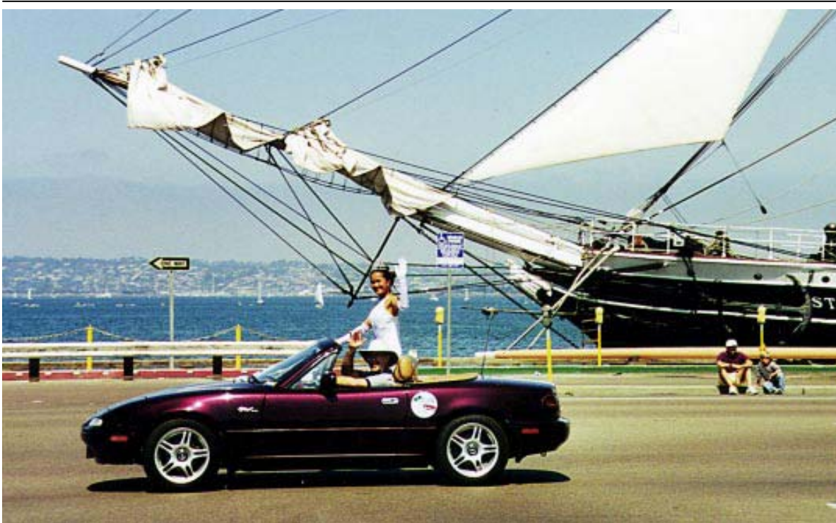
This photo, taken 10 years ago, captured a beautiful girl and a beautiful scene as SDMC participated in the Filipino Pride Parade at the Embarcadero.

No, this is not an everyday occurrence, but just once in a lifetime is one time too often, especially if it is due to having left that little insurance policy (valve cap) off. Most anyone can deal with a slow leak, even at speed, but a fast leak is no fun at all. The worst part is you will have unnecessarily ruined a tire, a wheel, your slacks (changing the tire), your shorts (death defying ride) and your day. The time saved leaving off those two-bit caps is definitely not worth the possible consequence!