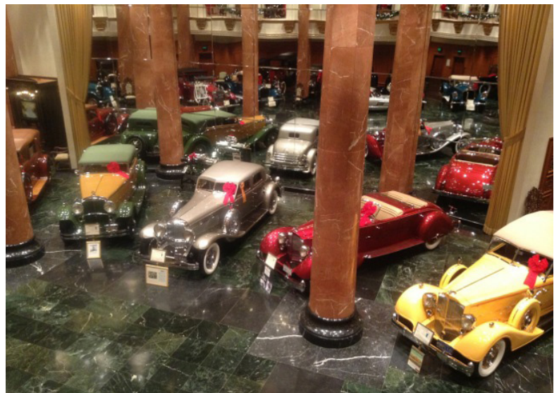
Provided By Rosi Romero

The Nethercutt showcases one of the best collections of rare vintage vehicles that I have ever seen and I could just picture myself behind the wheel of a Cord or Talbot - Lago Sport Coupe. Standing atop the grand staircase in the grand salon lent to a perfect view of over 30 of the most beautiful and luxury vehicles of the early 1900's