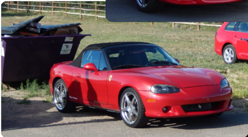
Apart from the "other" tradition, your author has a habit of parking near dumpsters ... it's a long story.