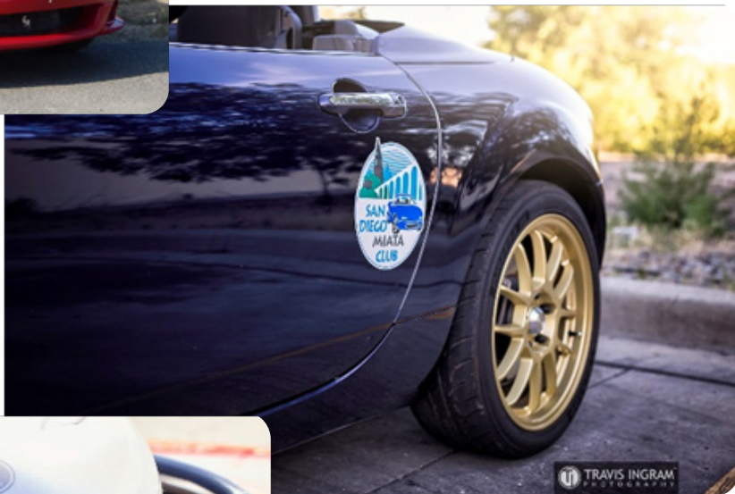
"Representing" SDMC in Grand Junction Don't tell Daryled his magnetics are crooked.