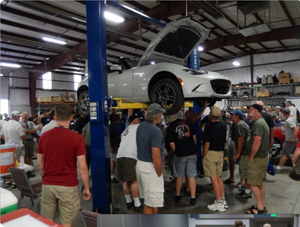
Tech Day seminars went all day Saturday at Flyin' Miata. Question: How many "summer campers" does it take to find the missing 200 lbs.?