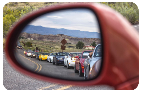
Summer Camp, entering Colorado Nat'l Monument