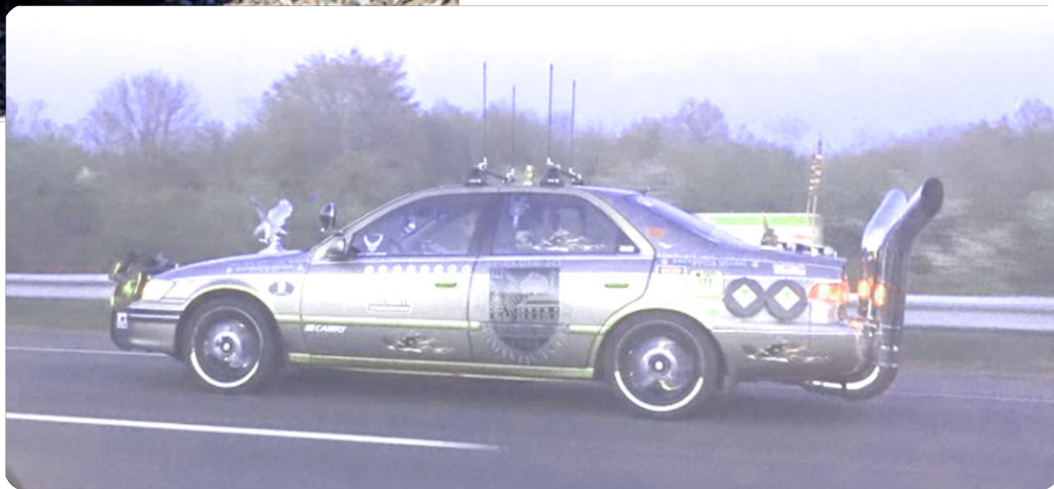
Those of you interested in a SkyActive diesel-powered Mazda 6, take heart. My son captured a photo of this "test mule" on the freeway headed to San Diego, thinly disguised as a security patrol vehicle that was magnetized and driven through Pep Boys – twice.

Stay classy, San Diego (Miata Club). Indeed! ■